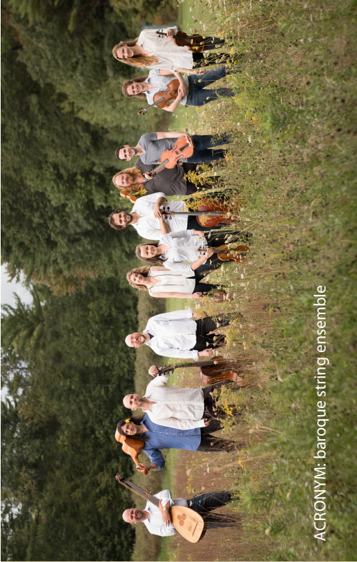
ACRONYM: baroque string ensemble

BRINGING THE WORLD'S FINEST PERFORMERS TO YOUNGSTOWN STATE UNIVERSITY.