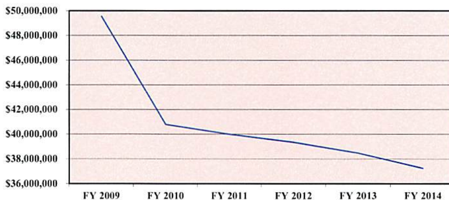
State Appropriations Fiscal Years 2009 through 2014

The following graph reflects five years actual data for State Appropriations plus the budgeted amount for fiscal year 2014. Fiscal years 2010 and 2011 do not include federal stimulus funds.