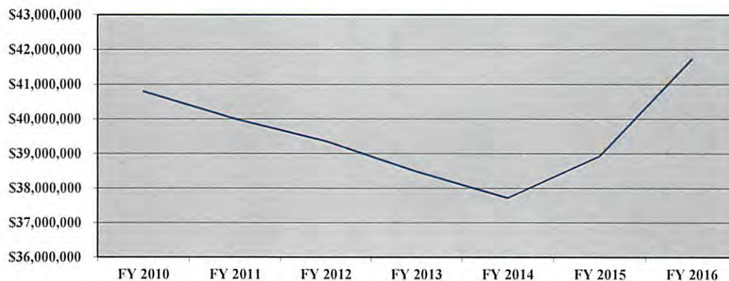
State Appropriations Fiscal Years 2010 through 2016

The following graph reflects six years actual data for State Appropriations plus the budgeted amount for fiscal year 2016. Fiscal years 2010 and 2011 do not include federal stimulus funds.